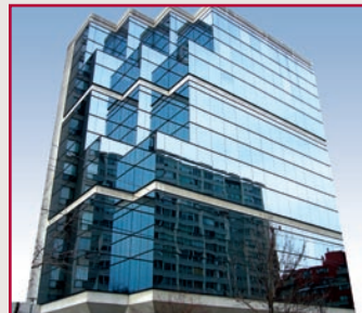
Holly Street Building Toronto, Ontario

West Park Mall is a 108,749 sq. ft. neighbourhood mall. The property includes national tenants such as Save-On-Foods, Movie Gallery, Dominos Pizza and Easy Home. It has an excellent location, central to the majority of Quesnel's regional population base. The property was acquired in 2005 for $6.0 million. The tenant profile is excellent and caters to every shopping need.