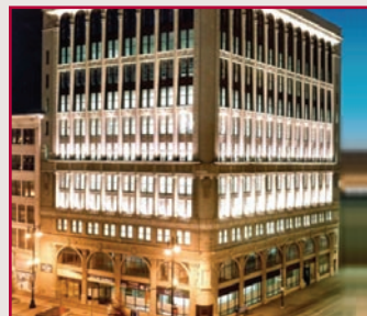
The Paris Building Winnipeg, Manitoba

Acquired January 2007 for $11.2 million. This 6-storey, 79,000 sq. ft. office building is conveniently located next to the GO TRAIN station. The Bus Terminal is literally on the ground floor of the building. The City of Brampton leases over 50% of the building. Today it is 98% leased. This property was sold for $14.0 million in April 2010.