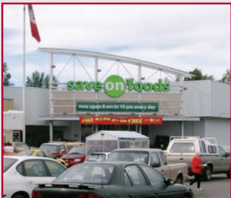
West Park Mall Quesnel, British Columbia

Acquired in June 2009 for $21.0 million, this refrigerated state-of-the-art cold storage distribution facility has a 39-foot clear freezer warehouse with computer guided forklifts. Churchill negotiated a 20-year, fully net long term lease with rent escalations every five years. This property was sold in January 2010, for $25.5 million, to a publicly traded REIT.