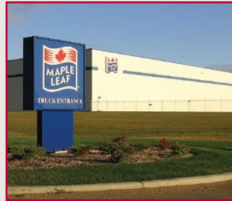
Maple Leaf Distribution Centre Saskatoon, Saskatchewan

Purchased in May 2010 for $34.7 million, this state-of-the-art single tenant office property investment was constructed with the latest in energy efficient design and technologies and is in the process of receiving a LEED Gold Status. (Leadership in Energy and Environmental Design (LEED) Green Building Rating System™). Churchill negotiated fully net long term lease with rent escalations.