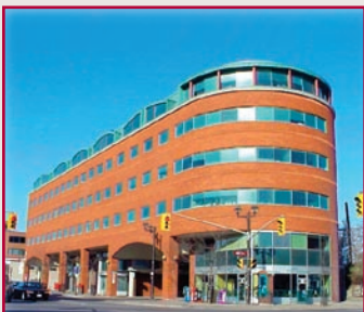
Brampton Executive Centre Brampton, Ontario

Acquired June 2008 for $11.8 million, well below replacement cost, when it was 30% vacant. Now 98% leased. Exceptionally well located 70,331 sq. ft. Class 'A' office building with 61 underground parking spaces, at Yonge St. and Eglinton Ave. near the Yonge St. Subway. This property was sold for $14.0 million in April 2010. Churchill was successful in signing 14 new leases in 18 months to create significant added value.